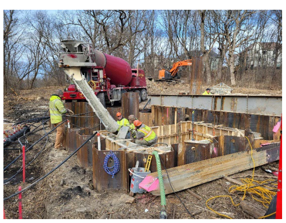
Cast-In-Place Concrete Structure at North Connection to the Existing Interceptor