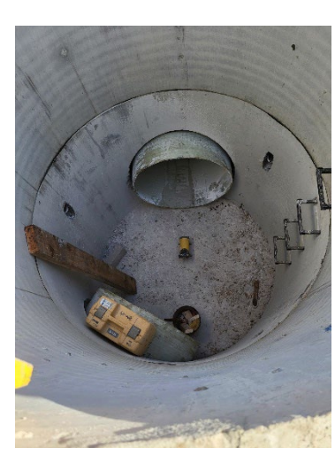
Inside of an Installed Manhole