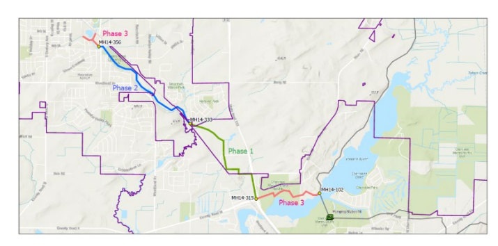
NEI – WE Capacity Improvement Overview