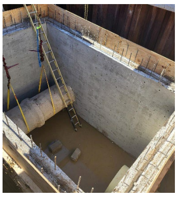
Dog Park Connection Manhole