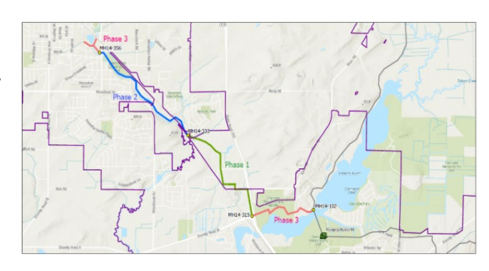
NEI – WE Capacity Improvement Overview