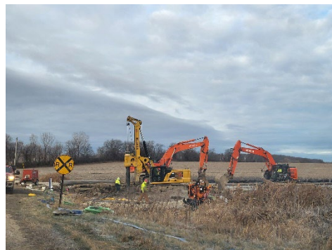
Installing Dewatering Ahead of Pipe Install