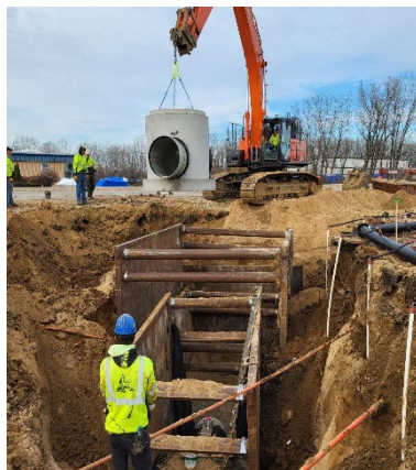
Setting Precast Manhole