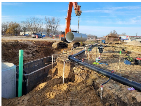
Setting Hobas Interceptor Pipe W/ Dewatering (black pipe)